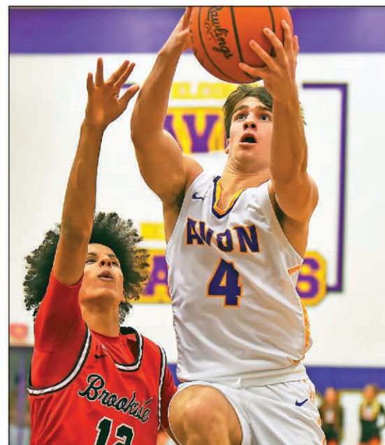
THOMAS FETCENKO/ CHRONICLE

12/29 .. Fairview 1/5 ..... Avon Lake 1/10 .... @ Olmsted Falls 1/13 .... Elyria 1/15 .... Normandy 1/17 .... @ Avon 1/20 .... North Ridgeville 1/24 .... Midview 1/26 .... Berea-Midpark 1/29 .... Brecksville 1/31 .... @ Westlake 2/2 ..... @ Avon Lake 2/7 ..... Olmsted Falls 2/10 .... @ Elyria 2/14 .... Bay