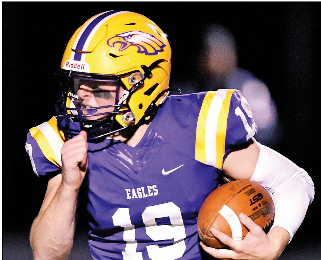
DAVID RICHARD/ CHRONICLE

8/18 @Valley Forge 8/26 @Buckeye 9/2 North Olmsted 9/9 North Ridgeville 9/16 @Midview 9/23 @Berea-Midpark 9/30 Avon Lake 10/7 @Olmsted Falls 10/14 Elyria 10/21 @Avon